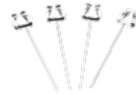
TABLE NUMBER STANDS

MPS0004 • MESSAGE PICK S/STEEL - PACK OF 4