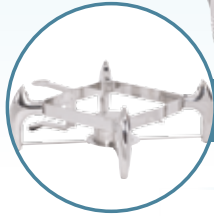
SQUARE STAND - CDS4001