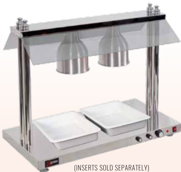
(INSERTS SOLD SEPARATELY)